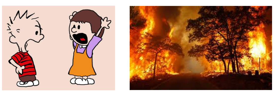
"...a tiny spark can set a great forest on fire. And among all the parts of the body, the tongue is a flame of fire. It is a whole world of wickedness, corrupting your entire body. It can set your whole life on fire" (3:5-7).